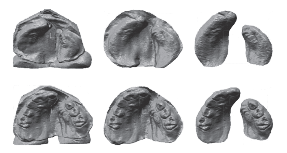
Fig. 1. Data processing using Pixform reverse engineering software. The figures from the left show raw and processed dental models of a UCLP patient with and without clefted gap; first row patient in To (before cheiloplasty), second row the same patient in T1 (before palatoplasty).

Geometric morphometric analysis was performed using MorphoStudio v 3.0 and Morphome3cs v 2.0 software. At first, dense correspondence analysis (DCA) was used to convert the models to the same number of triangular faces (Hutton et al. 2001). In the first step, a set of hand-placed landmarks was situated on each evaluated palatal surface. Generalised Procrustes analysis (GPA) was used to register these landmarks. The transformations obtained from GPA on landmarks were then applied on the surface models, resulting in a rigid alignment of these meshes. The centroid size of each virtual model was recorded for future analysis (more details in Bejdová et al. 2012).